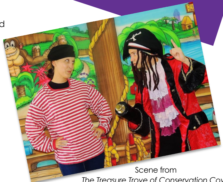
Scene from The Treasure Trove of Conservation Cove